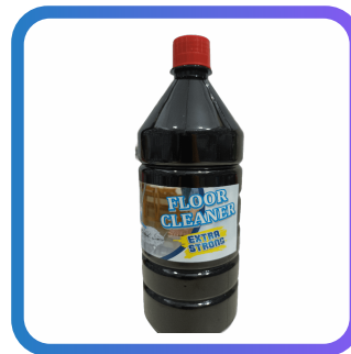
Black Phenyl Floor Cleaner - 500ml, 1 Liter & 5 Liter