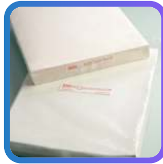
Clean Room Paper