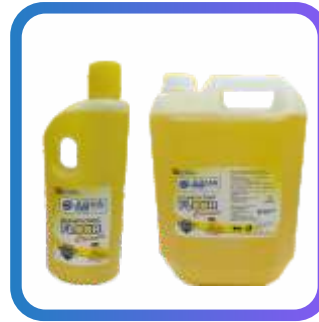
Premium Floor Cleaner (Lemon) - 500ml, 1 Liter & 5 Liter