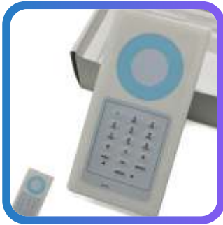
Clean Room Phone