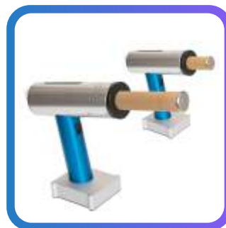
Air flow mapping - Fog Pistol