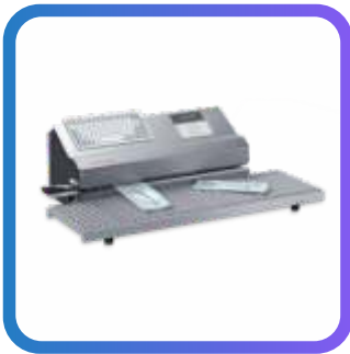
Impulse & Rotary Sealer