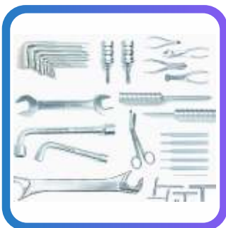
Cleanroom Tools - Wide variety of SS tools - Tools for critical environment - Products with Traceability - Fog pistol