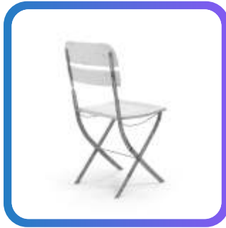
Clean Room Chair