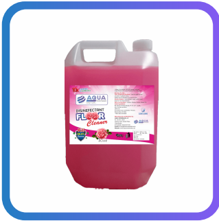
Premium Floor Cleaner (Rose) - 500ml, 1 Liter & 5 Liter