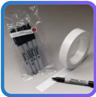
Clean Room Pen & Marker