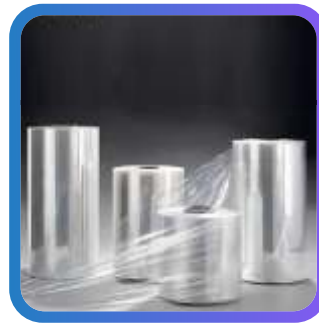
Ultra & BOPP Reel