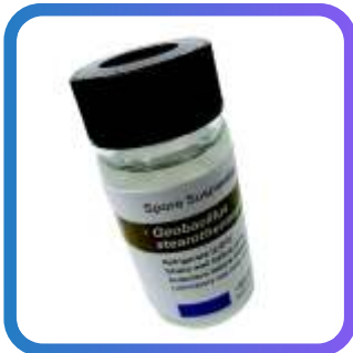
BD Test Pack