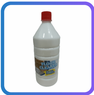
White Phenyl Floor Cleaner - 500ml, 1 Liter & 5 Liter